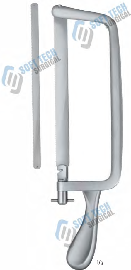
CHARRIERE, AMPUTATING SAW 23-0145 complete with one saw blade each 350 mm