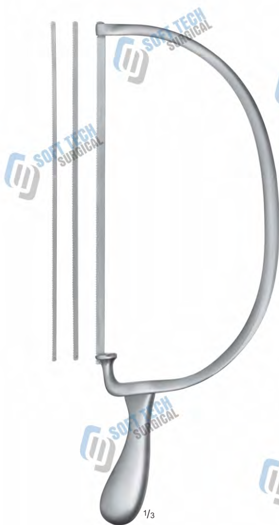
BIER, AMPUTATING SAW 23-0165 complete with one saw blade each 420 mm