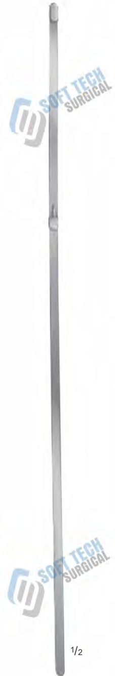
DE MARTEL CONDUCTOR 23-0205 350 mm