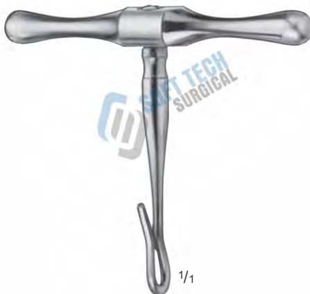
GIGLI HANDLE FOR WIRE SAWS 23-0195

23-0190 300 mm 23-0191 400 mm 23-0192 500 mm