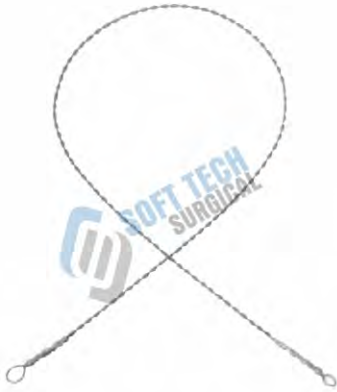
OLIVECRONA WIRE SAW

SOFT TECH Surgical, Manufacturer & Exporter of Quality Instruments