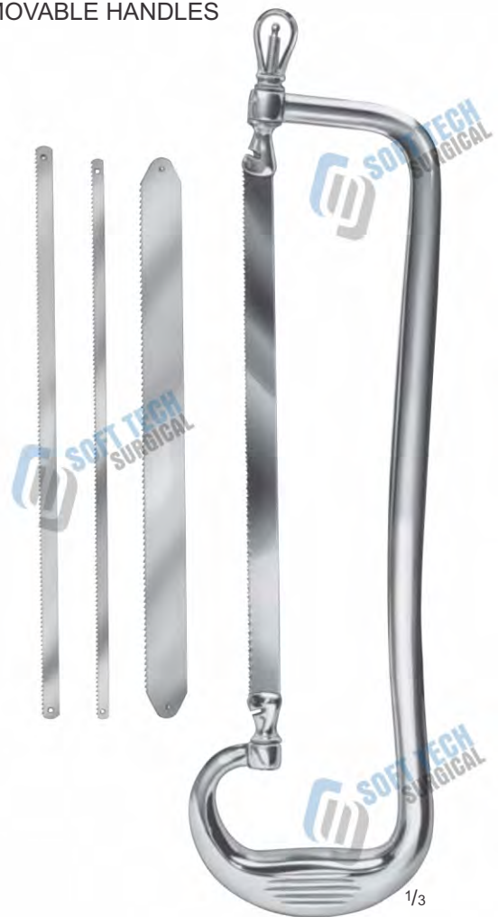
RUST, AMPUTATING SAW 23-0150 complete with saw blades 390 mm