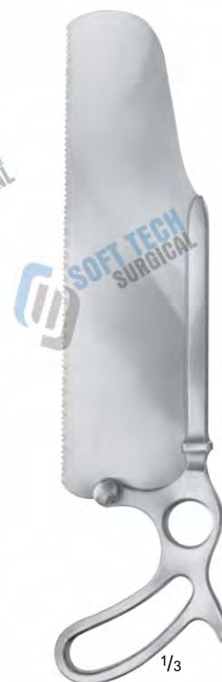
SATTERLEE AMPUTATION SAW 23-0180 290 mm Blade length: 200 mm