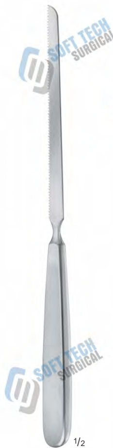
LANGENBECK METACARPAL SAW 23-0175 235 mm Blade length: 115 mm