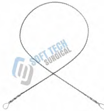
GIGLI WIRE SAW

23-0185 300 mm 23-0186 400 mm 23-0187 500 mm 23-0188 700 mm