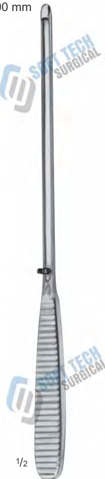
LEBSCHE CONDUCTOR 23-0200 250 mm