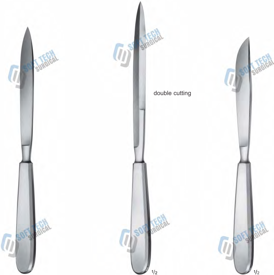
LISTON AMPUTATION KNIFE

Blade length: 23-0100 130 mm 23-0105 160 mm 23-0101 190 mm 23-0106 220 mm