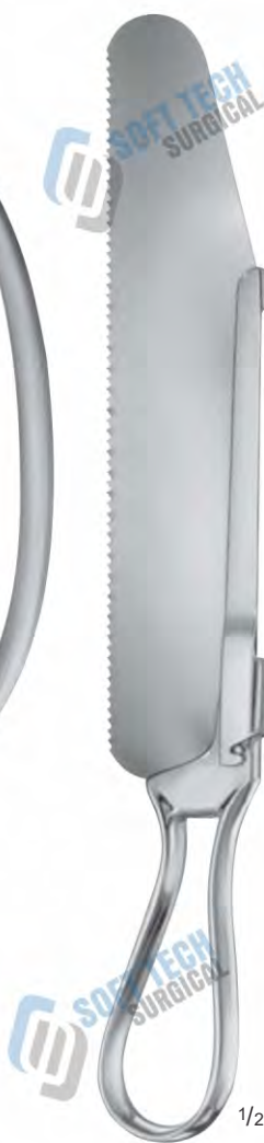
CHARRIÈRE AMPUTATING SAW 23-0170 Blade length: 184 mm