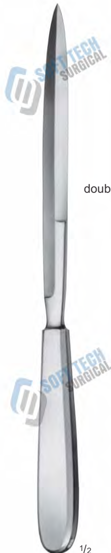
CATLIN Amputation knife Blade Size 02-0160 - 160mm