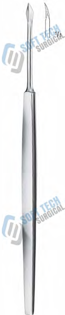
MASING CARTILAGE SLITING KNIFE 02-0200 130 mm