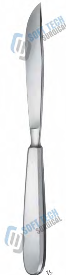
LANGENBECK FLAP KNIFE Blade Size 02-0165 - 120mm