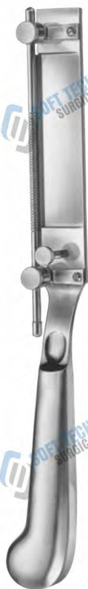
SCHINK DERMATOME 02-0210 adjustable from 0.1 to 2.0 mm, complete, with 1 interchangeable blade and 2 skin straightening plates 300 mm