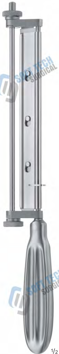
WATSON Skin graft knife, without blade 02-0235 300 mm