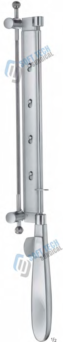
HUMBY Skin graft knife, without blades 02-0265 365 mm