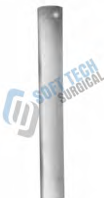
02-0220 Spare blade