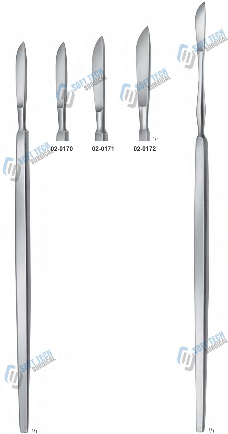
SIMON FISTULA KNIFE 200 mm

SOFT TECH Surgical, Manufacturer & Exporter of Quality Instruments