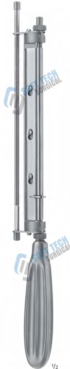
BRAITHWAITE Skin graft knife, without blade 02-0255 315 mm