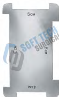
02-0215 Skin straightening plate