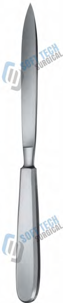
LISTON Amputation knives Blade Size 02-0150 - 130mm 02-0151 - 160mm 02-0152 - 190mm 02-0153 - 220mm