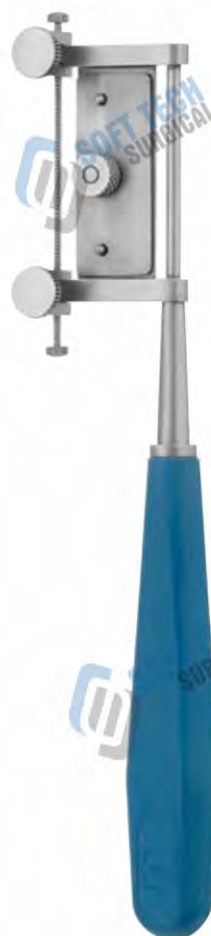
02-0230 Spare blade, SILVER Skin graft knife, without blade 02-0225 190 mm