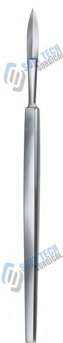
JOSEPH NASAL KNIFE 145 mm