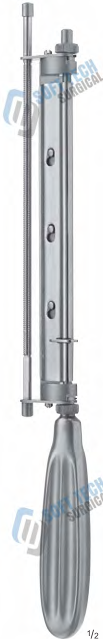
COBBETT Skin graft knife, without blade 02-0245 315 mm