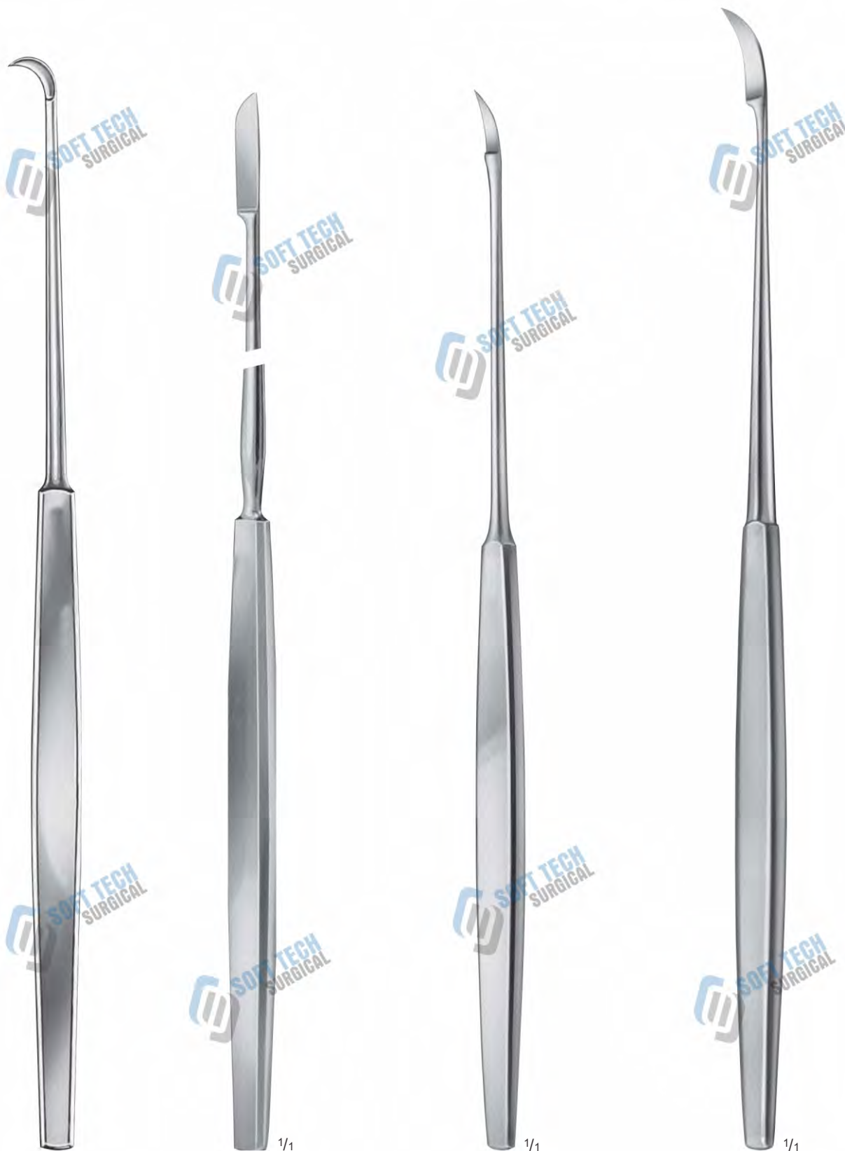
OLIVECRONA TRIGEMINAL KNIFE 02-0180 205 mm