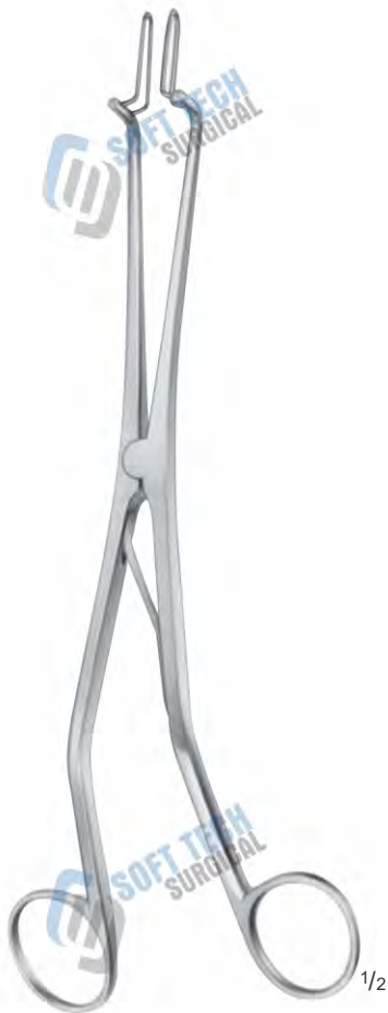
KOGAN, ENDOSPECULA with fixing screw 17-0200 240 mm